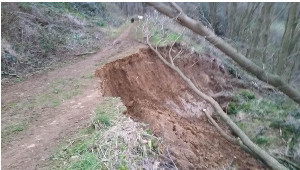
Recent Landslip In Stathern woods